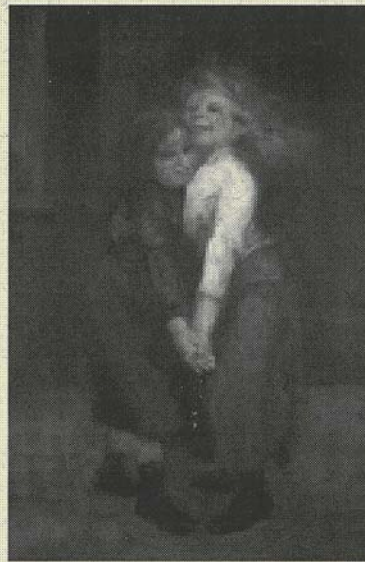
The Spielers, George Luks, 1905

§ Expansiveness: Consider success. The Holocaust Museum was planned for 250,000 visitors per year and receives 2 million. Consider expansion space before it's too late!